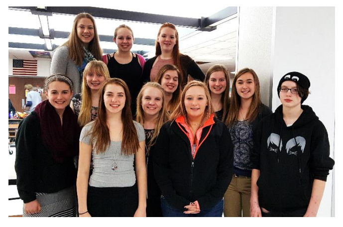
SubDistrict at Plainfield/TriCounty, February